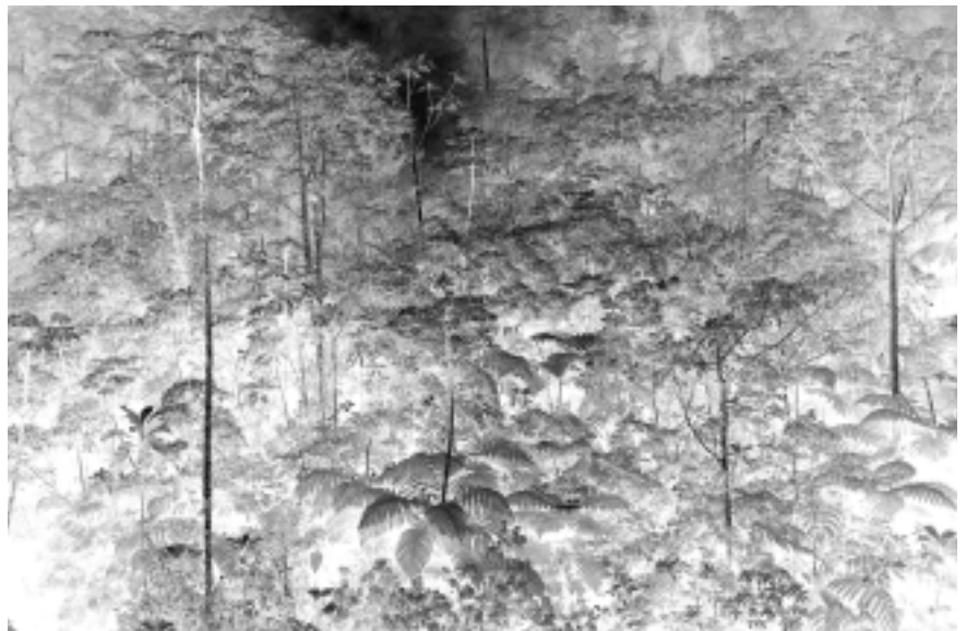
A rain forest in Guatemala displays a typical abundance and density of vegetation.

Tropical rain forests make up only about 7 percent of the earth's surface. However, more than half of the earth's plant and animal species live there. There are more varieties of amphibians, birds, and insects in rain forests than anywhere else in the world.